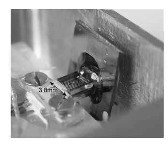
Fig. 2. picture of the fibre pigtailed device. Cleaved chip area is much larger than actually needed.

ature control. An Aluminium box serves as a housing for the component and as the thermal ground. Figure III shows a picture of the chip with attached connector, mounted in the housing box. The sample hangs in the air, with a highly conductive but still fairly long thermal path (aluminium + silicon) between Peltier element and chip. For the next generation, a more compact packaging approach will be used.